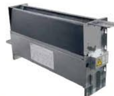
Fan coil unit without cabinet for concealed installation