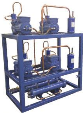
Condensing unit with two cooling circuits

Marine HVAC and Refrigeration Systems for Passenger Vessels, Merchant Ships and Mega Yachts