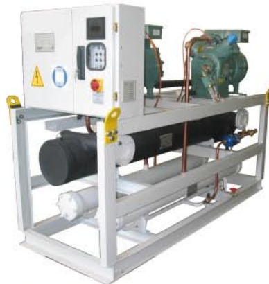
Water chiller with seawater cooled condenser